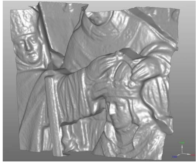
Fig. 8: Same detail as in figure 7, but seen from different angle.

We want to thank Westcam Datentechnik GmbH for the fruitful cooperation during the measurement process. Linsinger Vermessung, a private surveying company specializing in cultural heritage documentation, did an excellent job performing the photogrammetric documentation of the monument. Our acknowledgement refers – last not least – to the local authorities of Tyrol (Land Tirol, Landesbaudirektion) for the financial support and the continuous assistance solving the administrative problems.