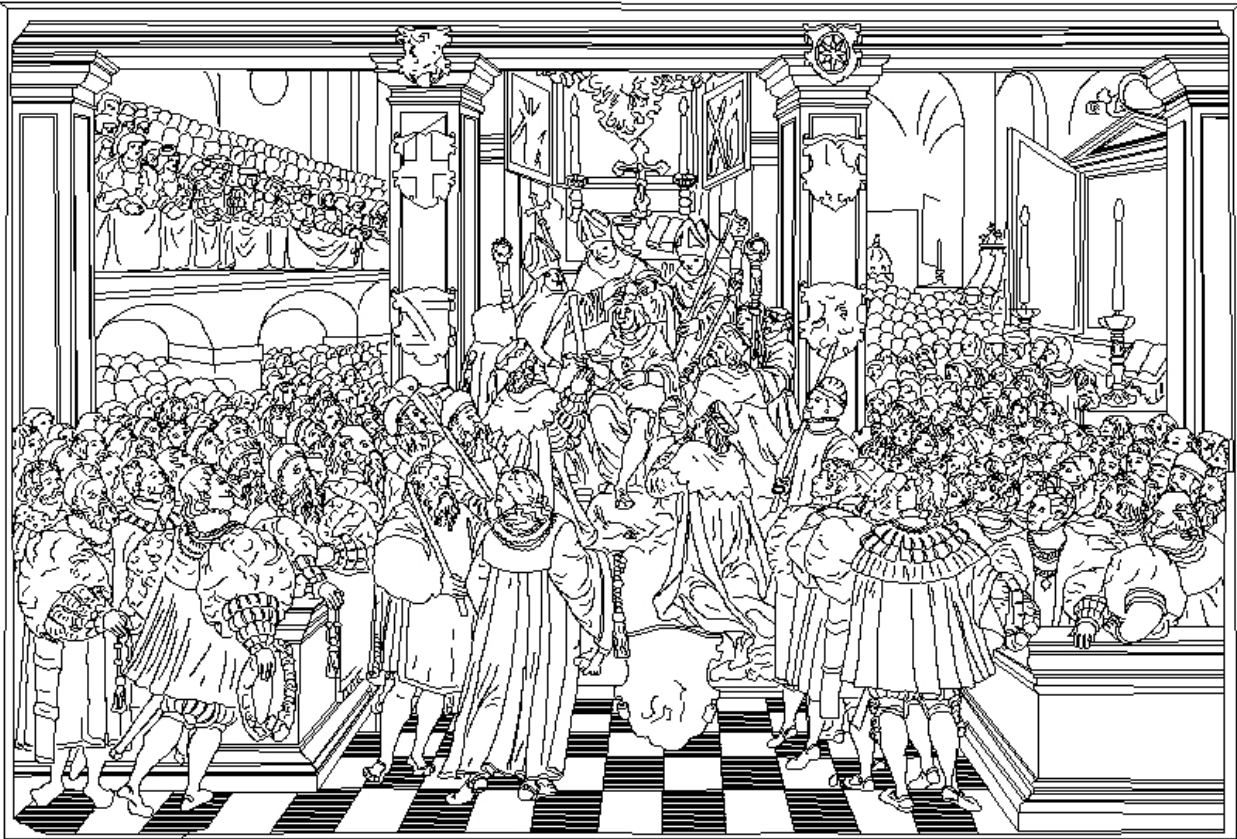
Fig. 5: Plot from stereophotogrammetric images (photographed and plotted by Linsinger Vermessung). Screenshot, scale about 1:5.