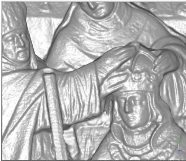
Fig. 7: Detail of figure 6. Scale about 1:1

Because of the processing limitations caused by the hard- and software which have been mentioned above, the 3D model of the whole cenotaph structure will remain relatively coarse as compared to the relief models. The 2 mm sampling as well as the poorer accuracy of the 3D points result in a good geometric model for the whole structure; detail resolution and neighborhood accuracy are not satisfactory, however. The procedures to be carried out are much the same as described for the high resolution model (section 4.1). A combination of all scanned and meshed information is not possible presently. There is little doubt that this can be accomplished in the near future.