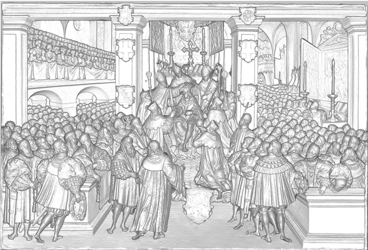
Fig. 6: Shaded view from high resolution scanning data. Screenshot, scale about 1:5.