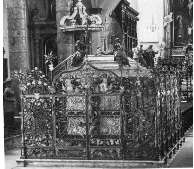
Fig. 2: Total view of the cenotaph - behind lattices – before the restoration work

The setting of tasks was not clearly defined – as is often the case in comparable projects, and had to be developed in co-operation with the responsible authorities. It stood firmly that the rare chance of accessibility from all sides should be used for documentation by all means. Of course, neither detailed plans nor art-historical documentations of this tomb were available at this time. Because of the preciousness of the object - and the uniqueness of the opportunity for data collection - accordingly a combination of geodetic measuring methods was suggested and carried out in May 2002.