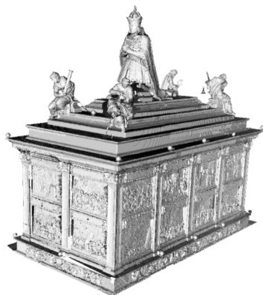
Fig. 4: Coarse resolution model (shaded view of point cloud)