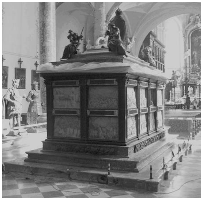
Fig. 1: Total view of the cenotaph during the measurement work – for the first time ever without lattices and glass plates